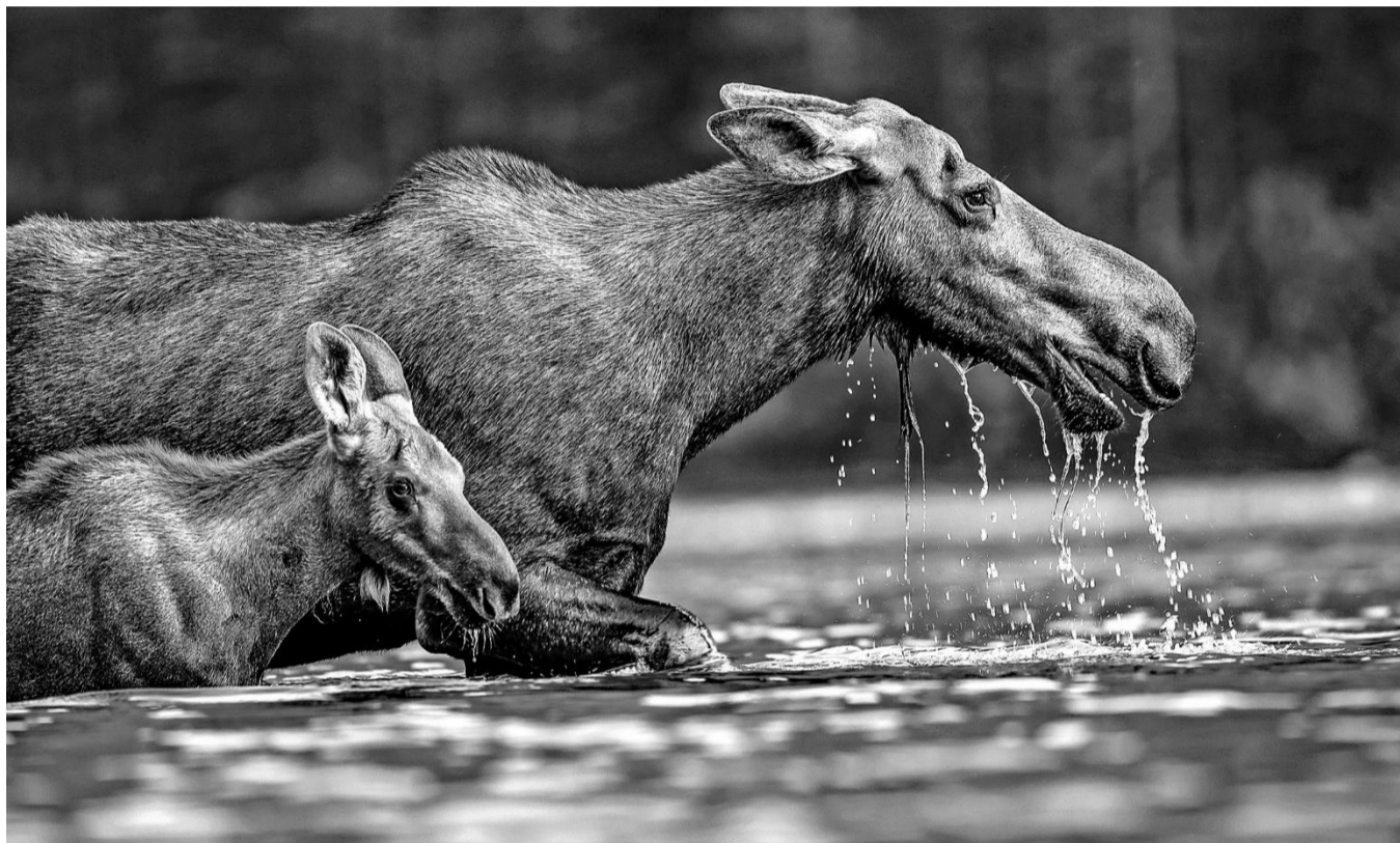
Best of Show – By Mom’s Side

Wisconsin Area Camera Clubs Organization