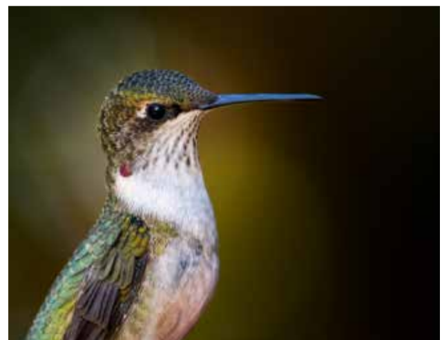
3rd Place - Beautiful Humming Bird Jerry Clish Fox Valley Camera Club