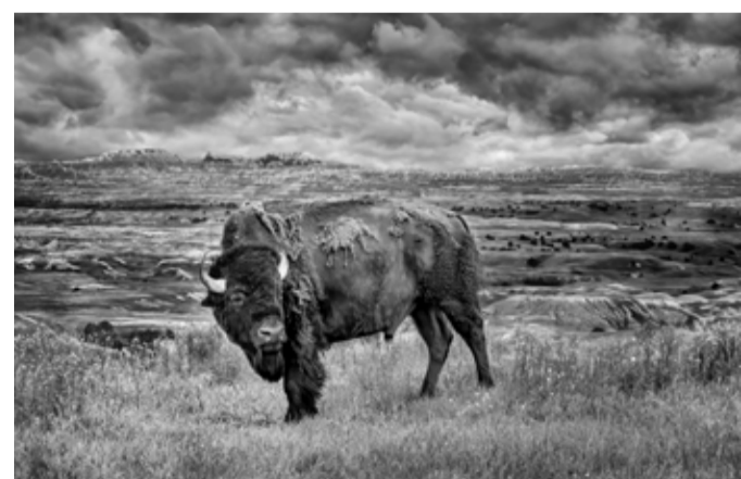
3rd Place - Badlands in the Evening Jerry Clish Fox Valley Camera Club