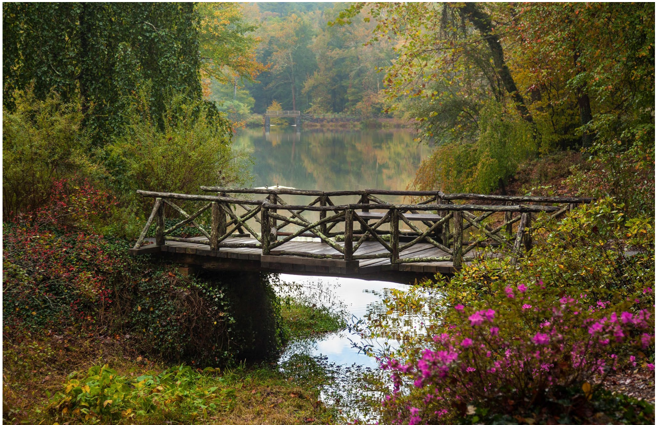
The Wooden Bridge Judith Pannozo - PSA Wisconsin Chapter