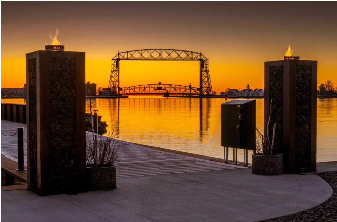
Duluth Lift Bridge