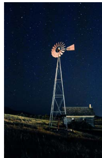
3rd Place South Dakota