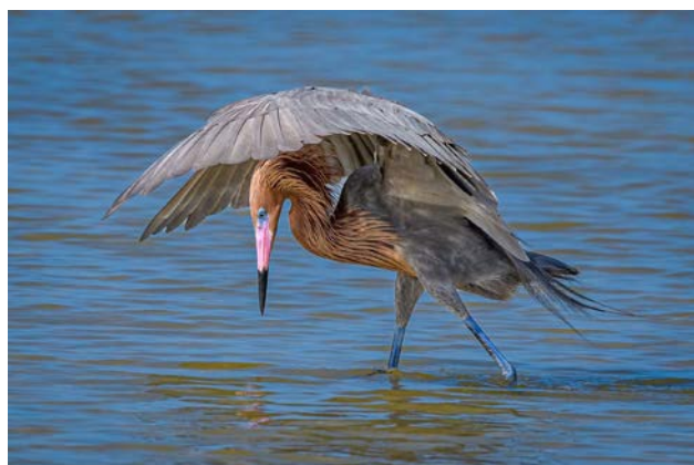
2nd Place Reddish Egret fishing