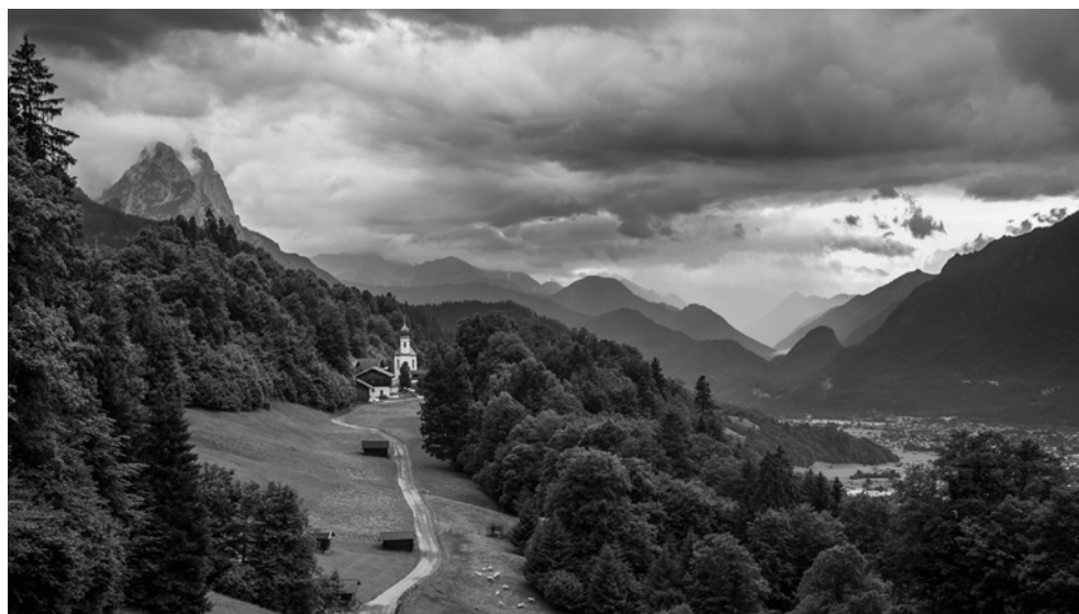
1st Place Road to Sky By Vinay Sinha Wehr Nature Center Camera Club