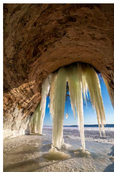
3rd Place At First Light By Diane Werner Unlimited Visions Camera Club