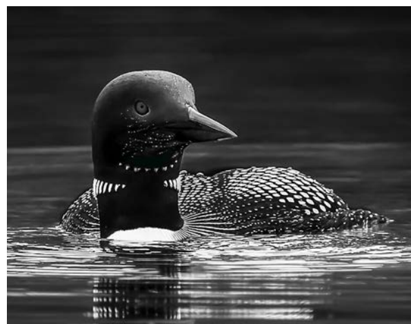
3rd Place Loon in BW