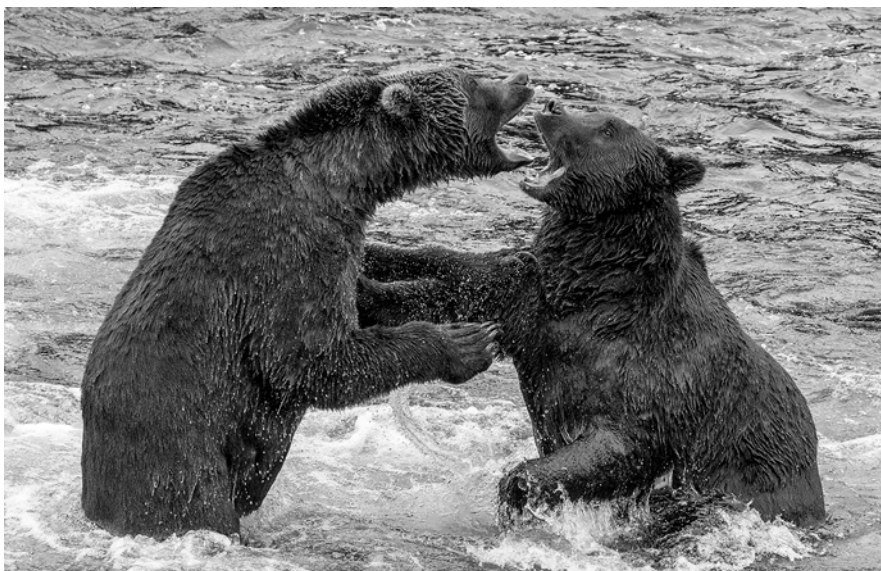
1st Place Duel for Fishing Spot