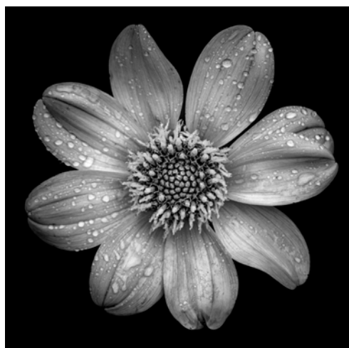
2nd Place Solo_0522