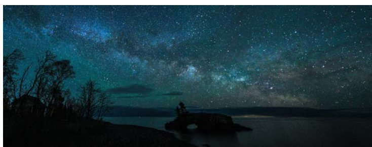
2nd Place Hollow Rock Milkyway 2021